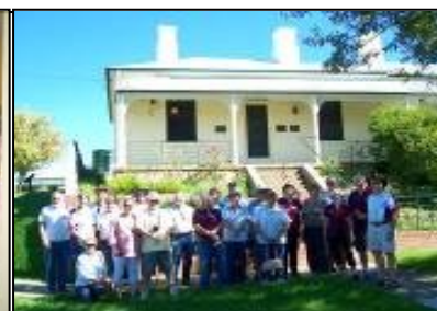
That's the kitchen. Members in front of the cottage

Immediately following the Chifley Cottage we made our way to the National Motor Racing Museum located at the base of Mount Panorama. On admission we were ushered into the theatre for a presentation. I have to seriously apologise, as the presentation in my view was appalling in a word. The previous presentation was actual filmed footage from years ago, not the current flick a pic of more current day events. I'm not sure whom wants to see this rubbish but I sure didn't, I wanted to see footage from the past, it is a museum supposedly. Moving on, we then made our way around the display of motor vehicles and it was also ordinary in my view, it has been expanded considerably, however it has been filled with vehicles of little interest, the current management has obviously lost the plot. The fact that most attendees went directly to the coffee shop pretty much confirms my summing up of the display. Should send a copy of this report to them to get the feedback they obviously require. Once we left here most made their way back to the Show ground but a few die hard rev heads made their way to the top of the Mount Panorama Circuit for a view towards the Blue Mountains that is just superb, awesome actually.