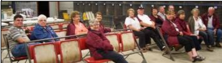
A few of the Chicks and Roosters gathered in the Poultry Pavilion.