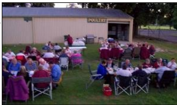
Members and Visitors enjoying the evening BBQ