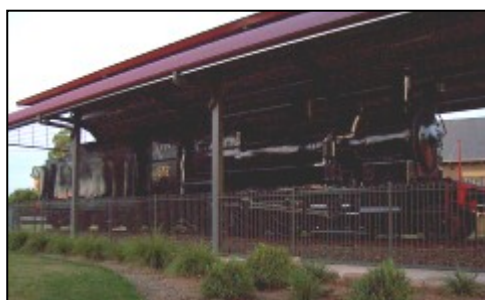
Steam Locomotive 5112

Once curiosities were answered we made our way to Bathurst Railway Station where Steam Locomotive 5112 is on display. This is the locomotive one Ben Chifley used to drive, yes before he was Prime Minister of Australia he was treasurer and before that, a humble Train Driver, how awesome was that? This should encourage all to follow your dreams.