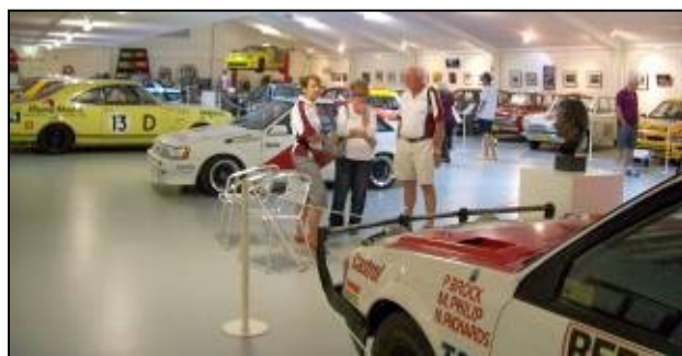
Viewing the Commodore that won the Round Oz Rally

Immediately following the Chifley Cottage we made our way to the National Motor Racing Museum located at the base of Mount Panorama. On admission we were ushered into the theatre for a presentation. I have to seriously apologise, as the presentation in my view was appalling in a word. The previous presentation was actual filmed footage from years ago, not the current flick a pic of more current day events. I'm not sure whom wants to see this rubbish but I sure didn't, I wanted to see footage from the past, it is a museum supposedly. Moving on, we then made our way around the display of motor vehicles and it was also ordinary in my view, it has been expanded considerably, however it has been filled with vehicles of little interest, the current management has obviously lost the plot. The fact that most attendees went directly to the coffee shop pretty much confirms my summing up of the display. Should send a copy of this report to them to get the feedback they obviously require. Once we left here most made their way back to the Show ground but a few die hard rev heads made their way to the top of the Mount Panorama Circuit for a view towards the Blue Mountains that is just superb, awesome actually.