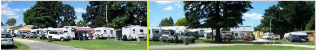
The entire camp, all twenty four of us at the Bathurst Showground.

The week prior was off to a shaky start as the weather wasn't being too kind to us, as all whom attended the Forbes State Rally just prior would know. Eventually the rain cleared and the much publicised surrounding flood waters resided, Phew, What a relief. Now it was just a case of convincing attending members that the showground wasn't underwater as was being alleged, a simple image emailed out clarified the situation and whalla, 24 vans out of 27 arrived, only three cancelled.